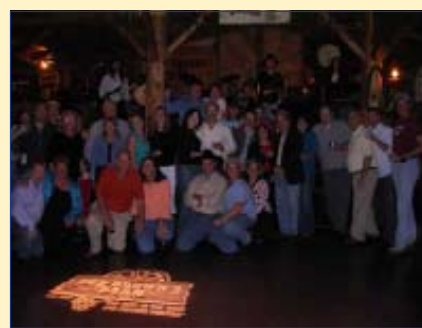
The last group poses together after a night of Western-style fun and dancing.