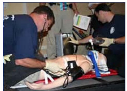
Teams from Alabama (left), Italy (center), and Florida (right) compete in the 2005 Competition finals. The scenario involved a bicycle accident.