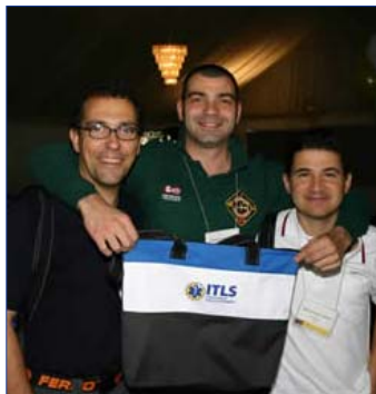
The ITLS Competition team from Italy displays the ITLS tote bag handed out as part of the name change festivities.

The awards ceremony also recognized several individuals for their contributions to ITLS. (See story on Page 3.)