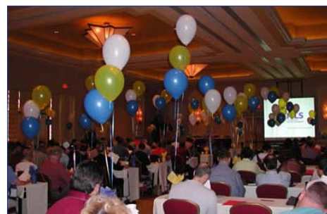
Participants were greeted with ITLS balloons and a film clip to announce the name change.