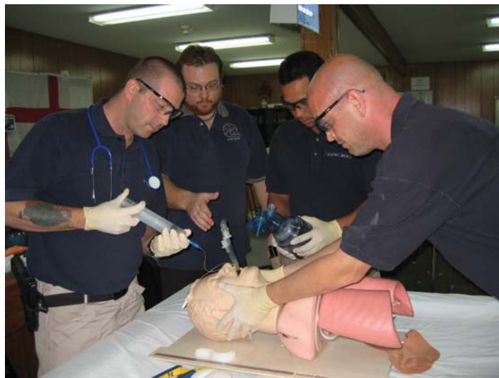
Security personnel at a U.S. contractor camp in Iraq practice insertion of a multi-lumen airway during an ITLS Basic course.

RIGHT: ITLS courses are conducted at the contractor camps in order to provide all security personnel, who are typically the first responders to any trauma, with common knowledge and skills for trauma response.