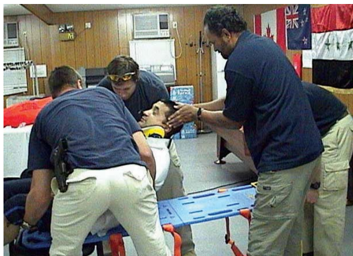
Participants learn to immobilize the c-spine as part of the ITLS training provided at Camps Basrah, I.Z., and Kanun in Baghdad.